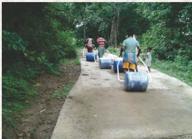
WATER ON WHEELS IN USE