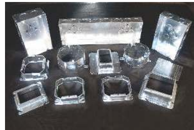
STEEL SWITCH BOXES