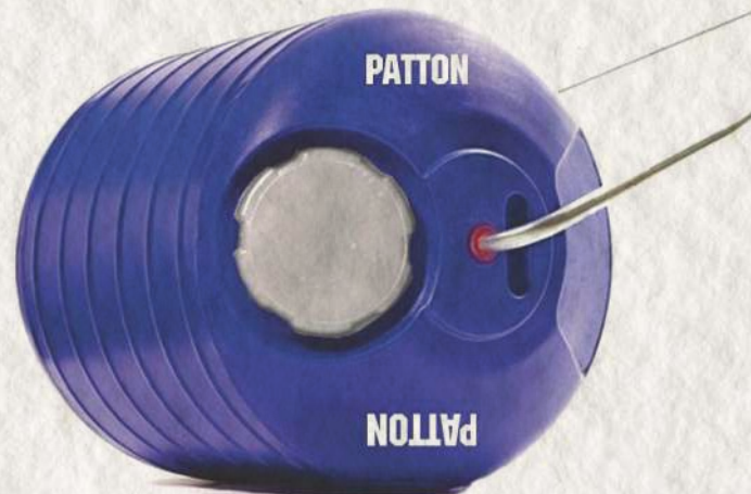
WATER ON WHEELS