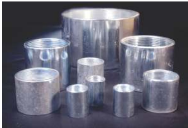
RIGID CONDUIT COUPLINGS