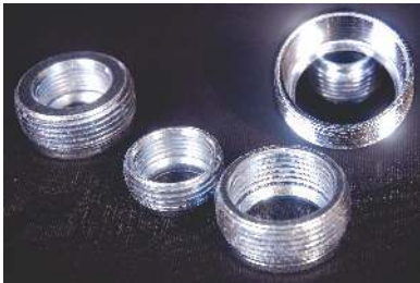
REDUCER CONDUIT BUSHING