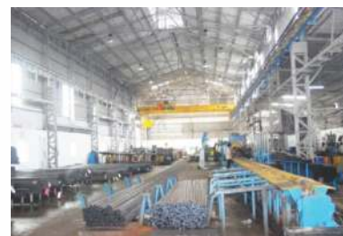
ERW PRECISION TUBES