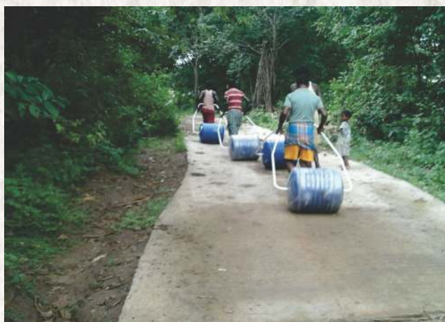
WATER ON WHEELS IN USE