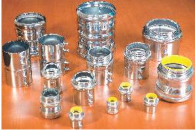
EMT CONDUIT FITTINGS