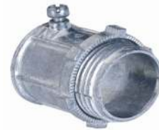
DIE CAST CONDUIT FITTINGS