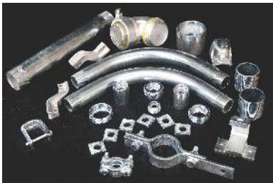
MISC. RIGID FITTINGS