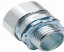
RIGID CONDUIT FITTINGS