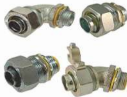
LIQUID TIGHT FITTINGS