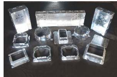
STEEL SWITCH BOXES